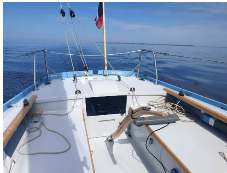
Pen-Hir #1 avec son nouveau moteur thermique 6 ch Cockpit repeint en 2024