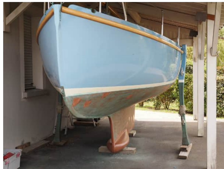
Pen-Hir #1 avant mise à l'eau 2024