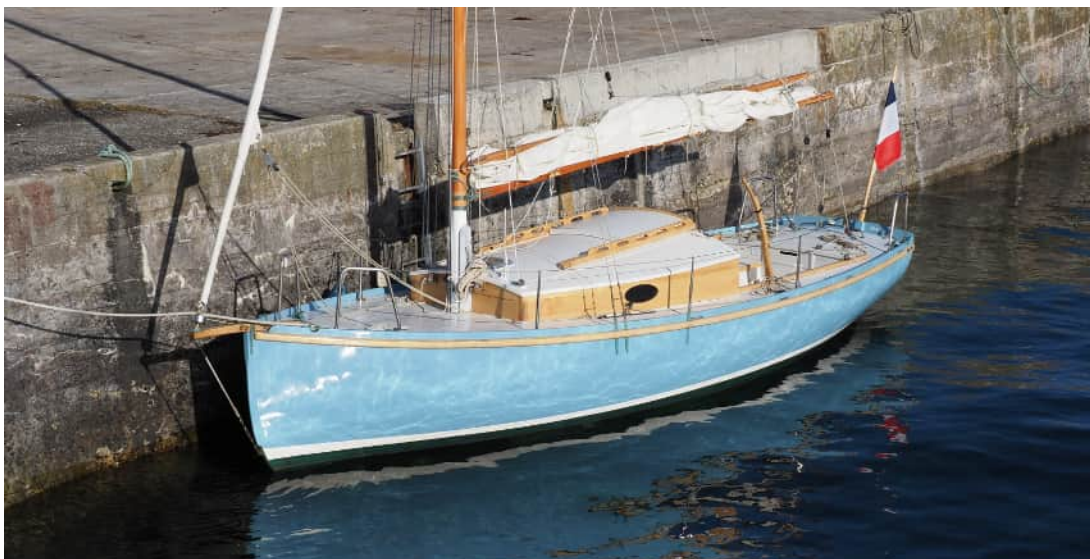
Pen-Hir #1 à Molène