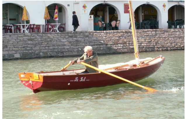
Plywood Seil (old version)

Seil is particularly easy to build in its wooden version, which has also the advantage of a greater lightness. Indeed, the planks (9 mm plywood) are very few and do not have any twist. They naturally take place on a building frame made up in particular of transverse bulkheads and both transoms.