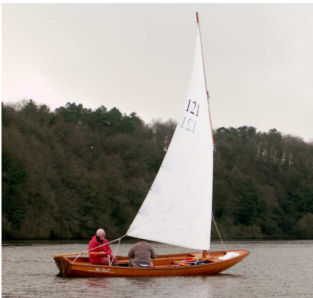
Timber built Seil by Canotage de France