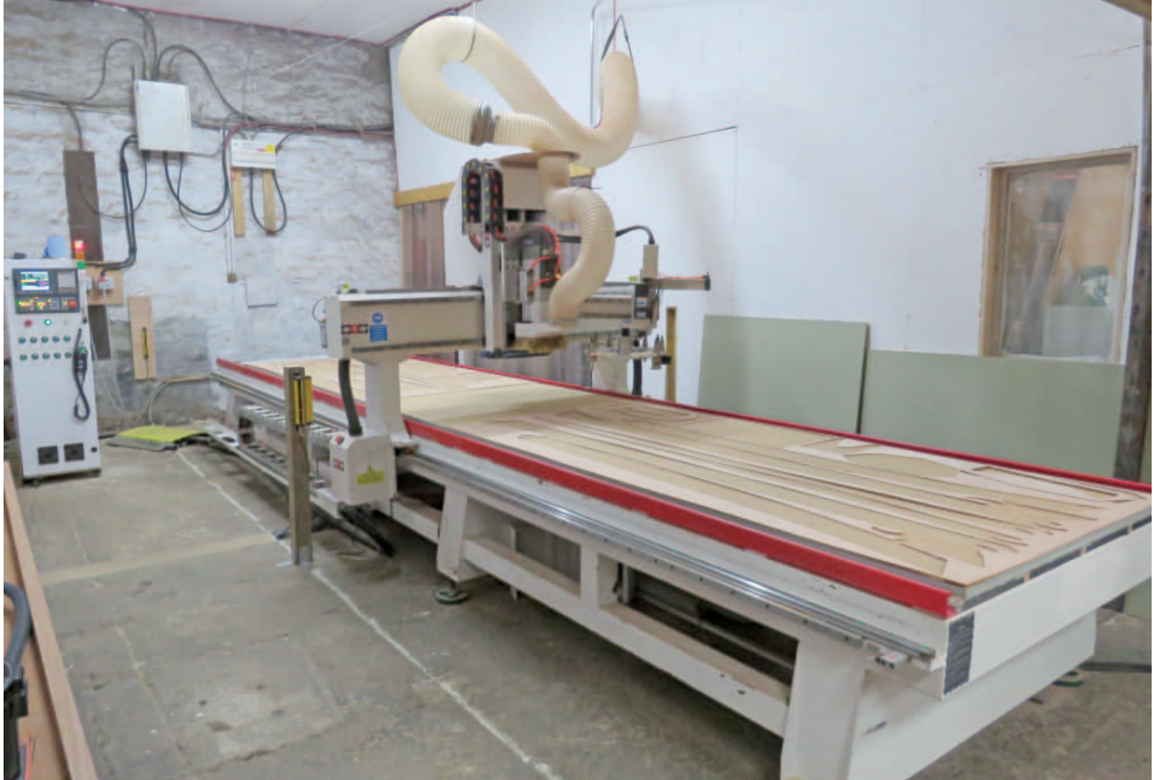
Above: The CNC table cuts kits for over 120 different designs